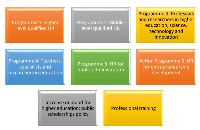
Figure 2: Action programmes of PNFQ

The PNFQ is structured in <u>action programmes</u>, which jointly contribute to reform and strengthen the overall system of education and training (Figure 2).