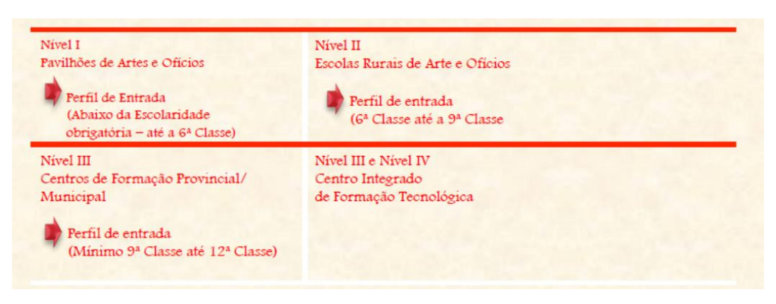
Figure 5: SNFP - levels

The level structure of the SNFP is particular, as levels are linked with the type of training institution and admission level of learners (Figure 5).