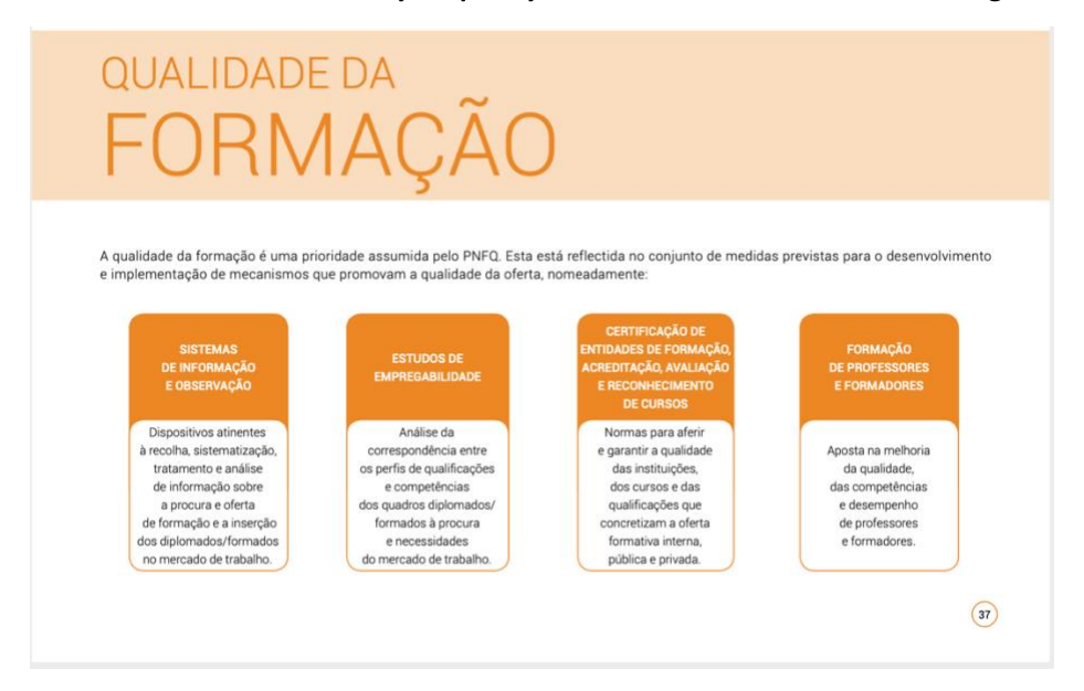
Figure 8: PNFQ - The multidimensionality of quality assurance in education and training